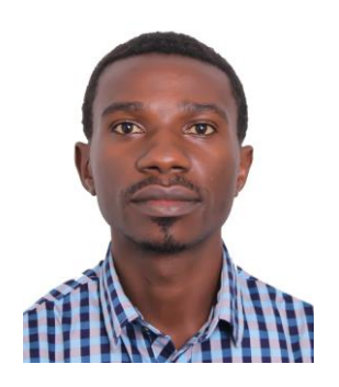
Upload your photo here.

Mode of Presentation: Oral/Poster. Contact number: +250 788977117