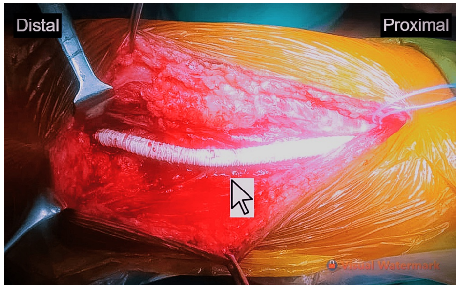
FIGURE 2: A 6-mm polytetrafluoroethylene (PTFE) graft, establishing a femoropopliteal bypass graft from the right distal superficial femoral artery to the popliteal artery, above the level of the knee.